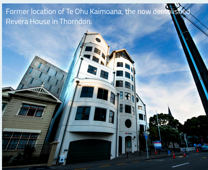
Former location of Te Ohu Kaimoana, the now demolished Revera House in Thorndon.

The earthquake insurance claim from the November 2016 event still remains outstanding, however we are close to agreeing the to a final amount.