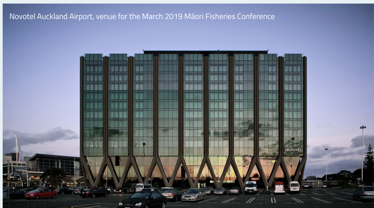
Novotel Auckland Airport, venue for the March 2019 Māori Fisheries Conference

Part of this year's planning process has involved reviewing the previous two conference survey results, and implementing requests and suggestions from Iwi to improve attendees experiences and their return on investment.